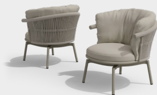
LOUNGE CHAIR 07712-10

CESTA draws its inspiration from traditional basket weaving methods. From ancient plaiting and coiling to modern industrial weaving designed for elevated outdoor style, enjoyment, and durability, today's artisans interpret time-honoured skills using aluminium and rope. Distinguished by clean lines and minimal adornment, CESTA's woven backrest plays the starring role. The sumptuous cushioning complements the sleek frame, while the seat offers gentle movement from side to side.